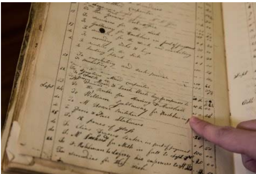
Accounting ledgers reviewed at the Georgetown University Library from the 1820s show financial transactions dealing with slaves.

Now, the 16- and 17-year-old students are left to grapple with this complicated and troubling history.